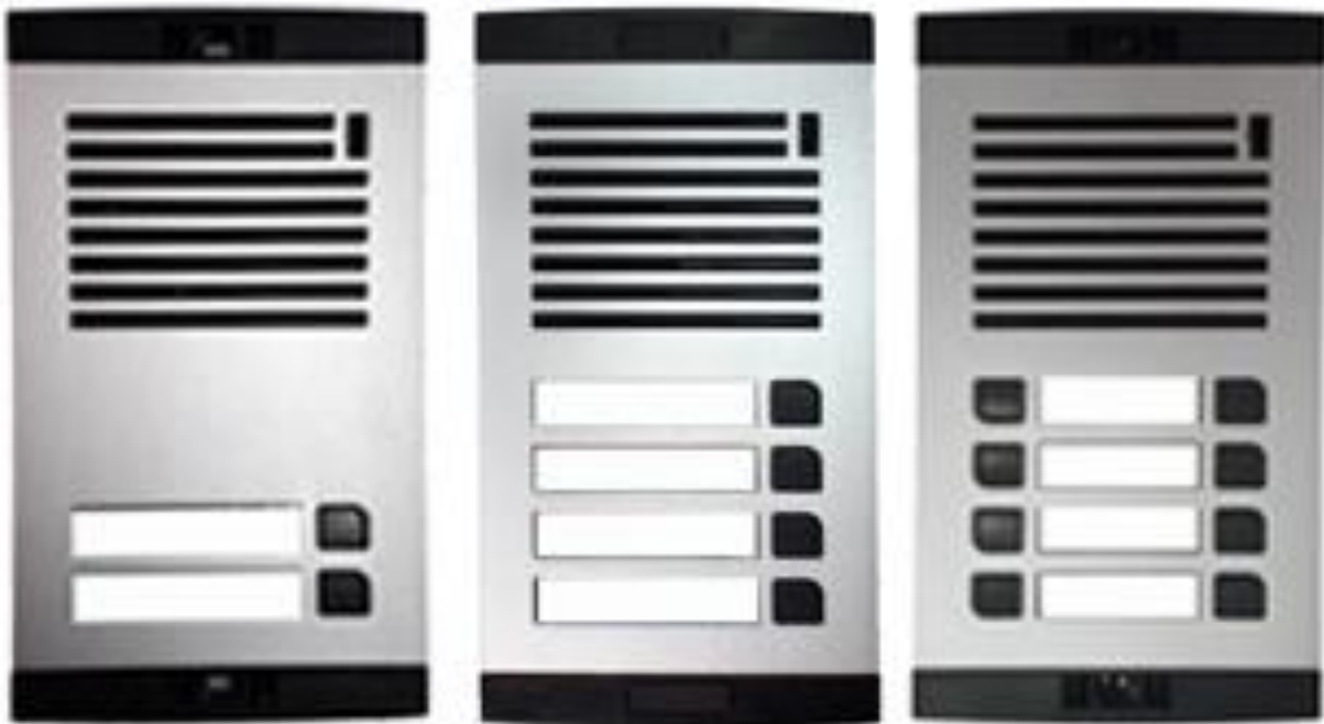
Figure 1: Enclosures options